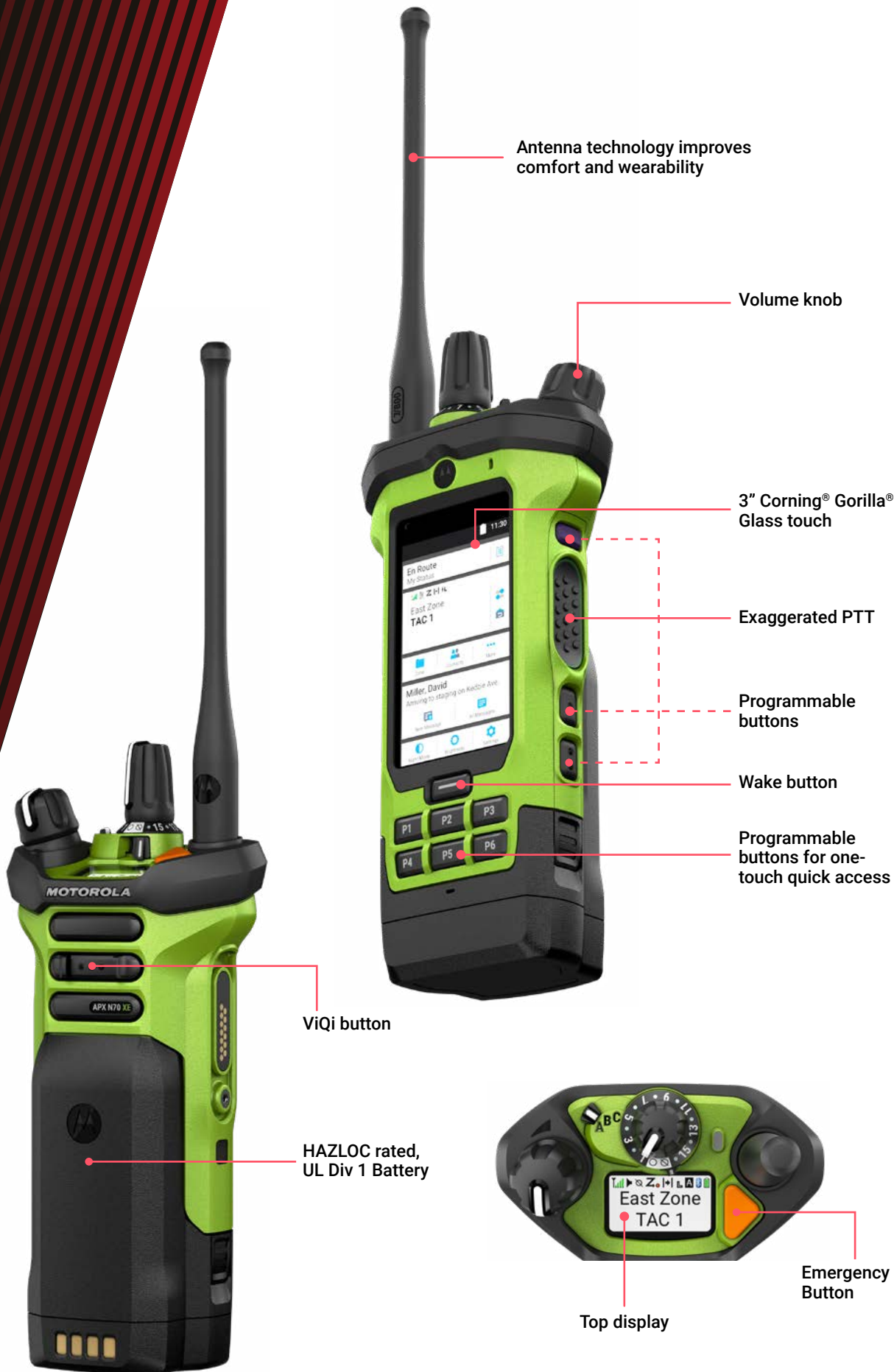
Antenna technology improves comfort and wearability