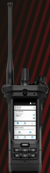
Also available in black